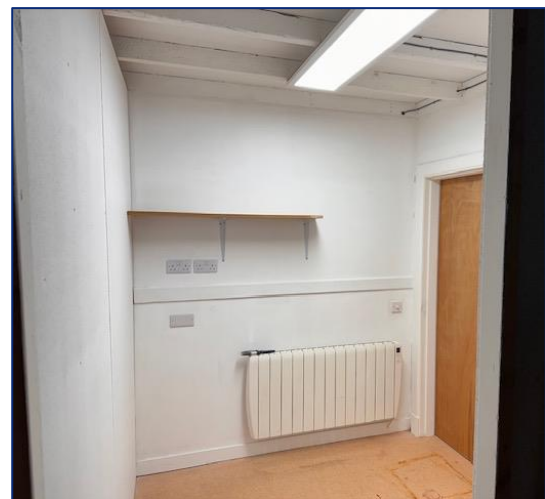
The Shed's new CNC enclosure – work in progress