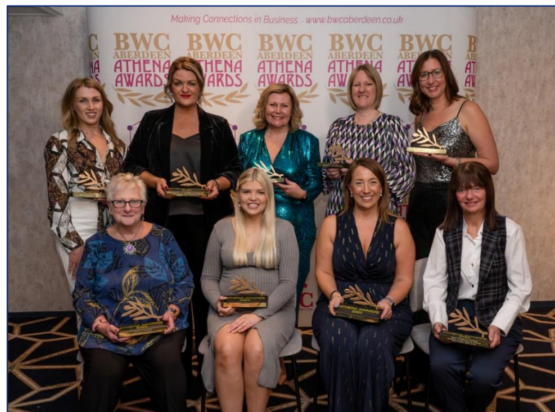
Athena Awards 2023 winners with their trophies